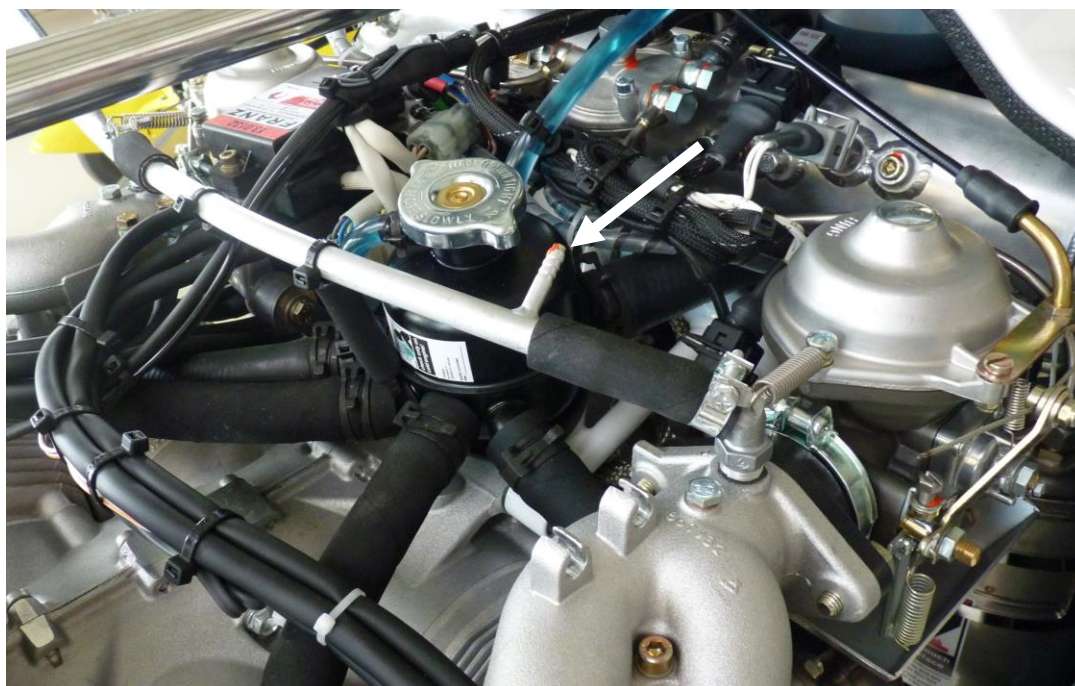
Fig. 3 – Connecting piece manifold pressure engine side (MTO)