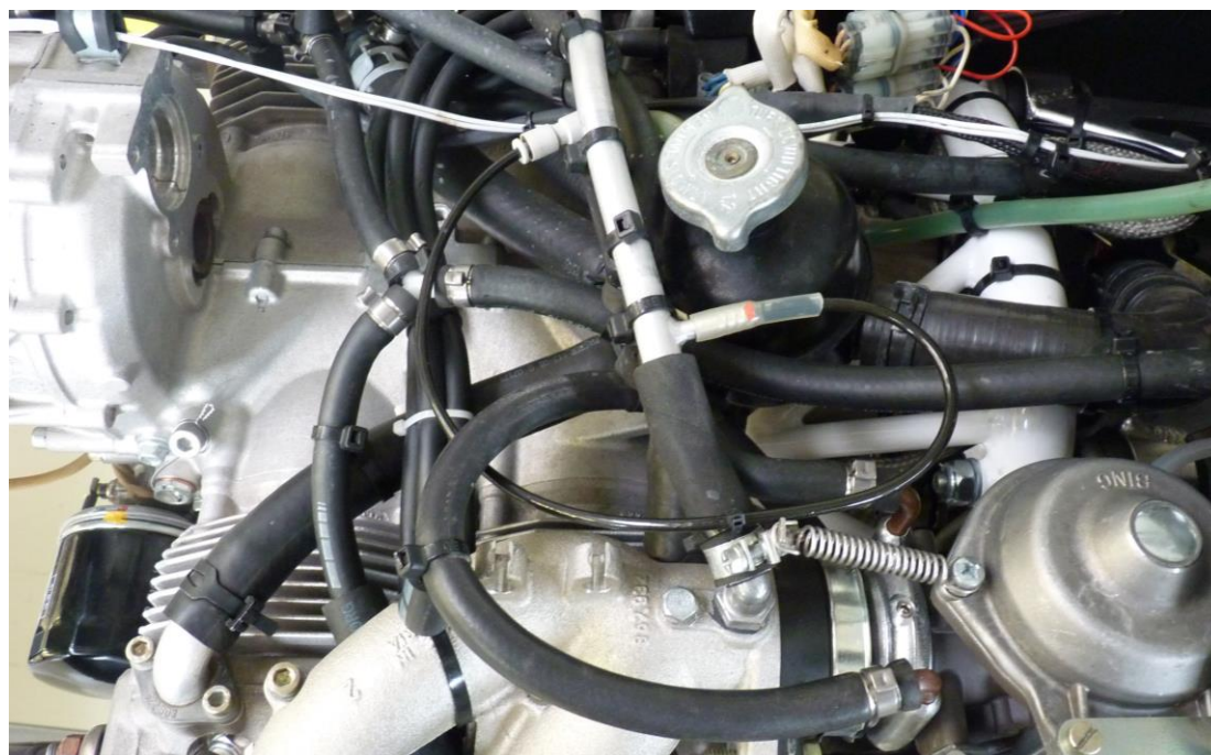
Fig. 4 – Manifold pressure hose connected on engine side