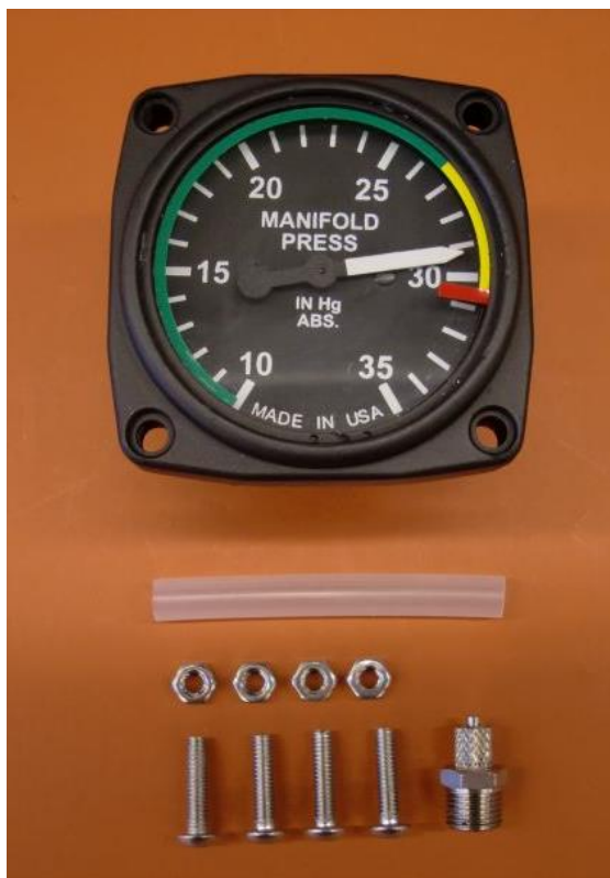
Fig. 1 - Manifold Pressure Gauge 912 ULS