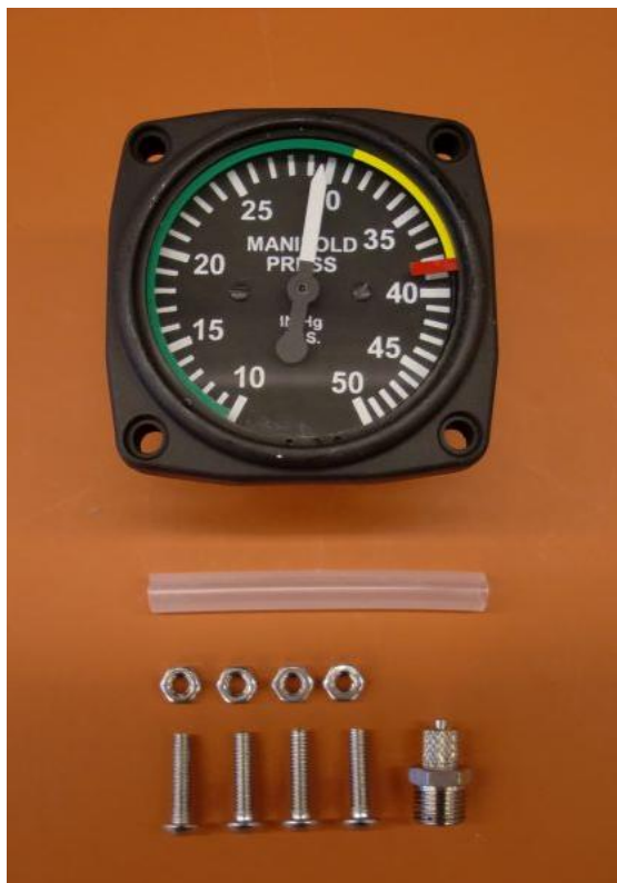
Fig. 2 - Manifold Pressure Gauge 914 UL