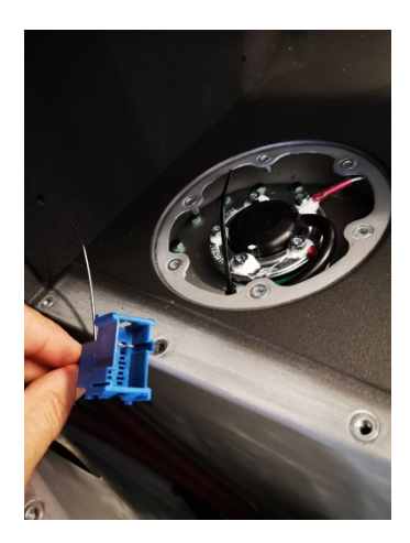
Tank level sensor plug