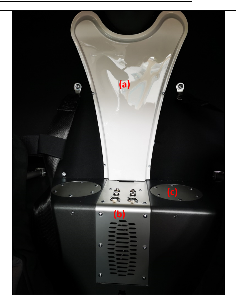
Interior – PPC cover (a), intercom panel (b) & Tank access covers (c)