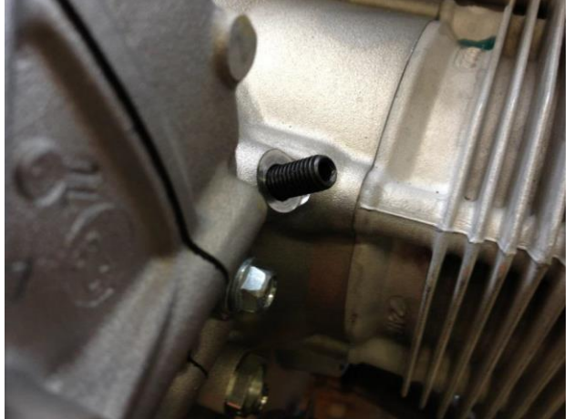
Fig. 3 - Thread Pin M8x50