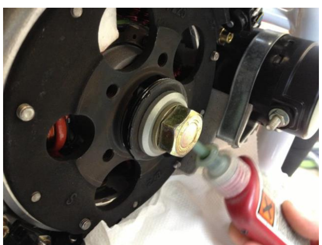
Fig. 4 – Loctite 648 on inner and outer thread