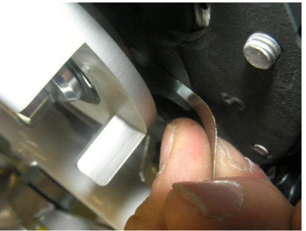
Fig. 6 – Correct mounting position