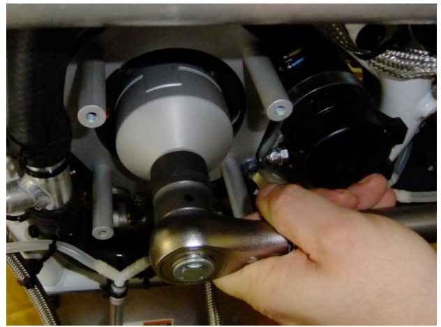
Fig. 5 – Torque dog gear with 140 Nm