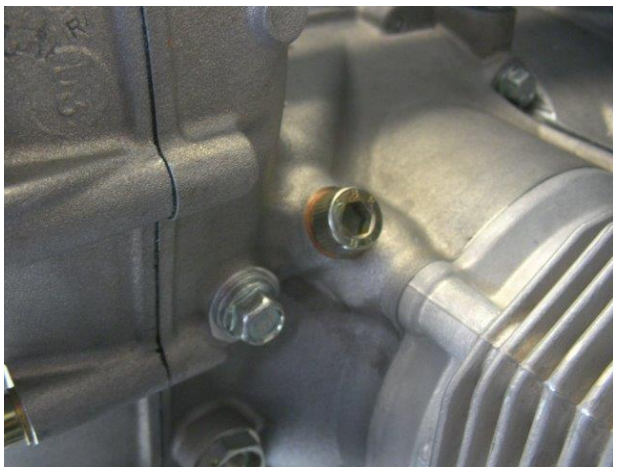
Fig. 2 - M8x20 screw plug