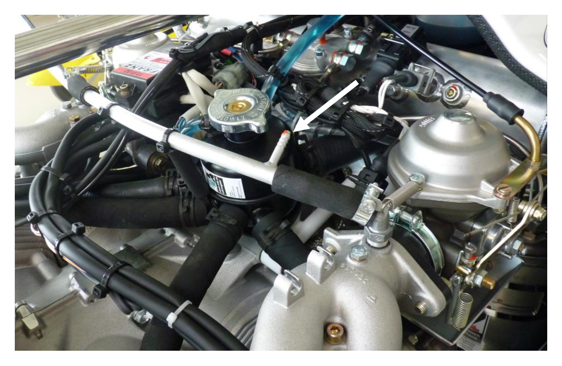
Fig. 3 – Connecting piece manifold pressure engine side (MTO)