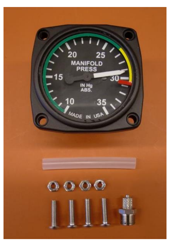
Fig. 1 - Manifold Pressure Gauge 912 ULS