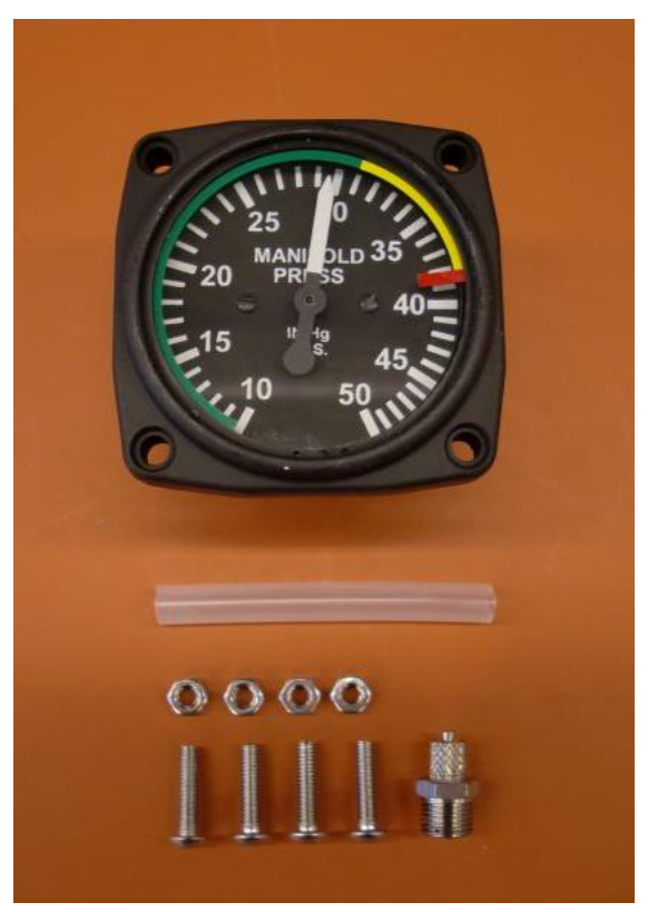
Fig. 2 - Manifold Pressure Gauge 914 UL