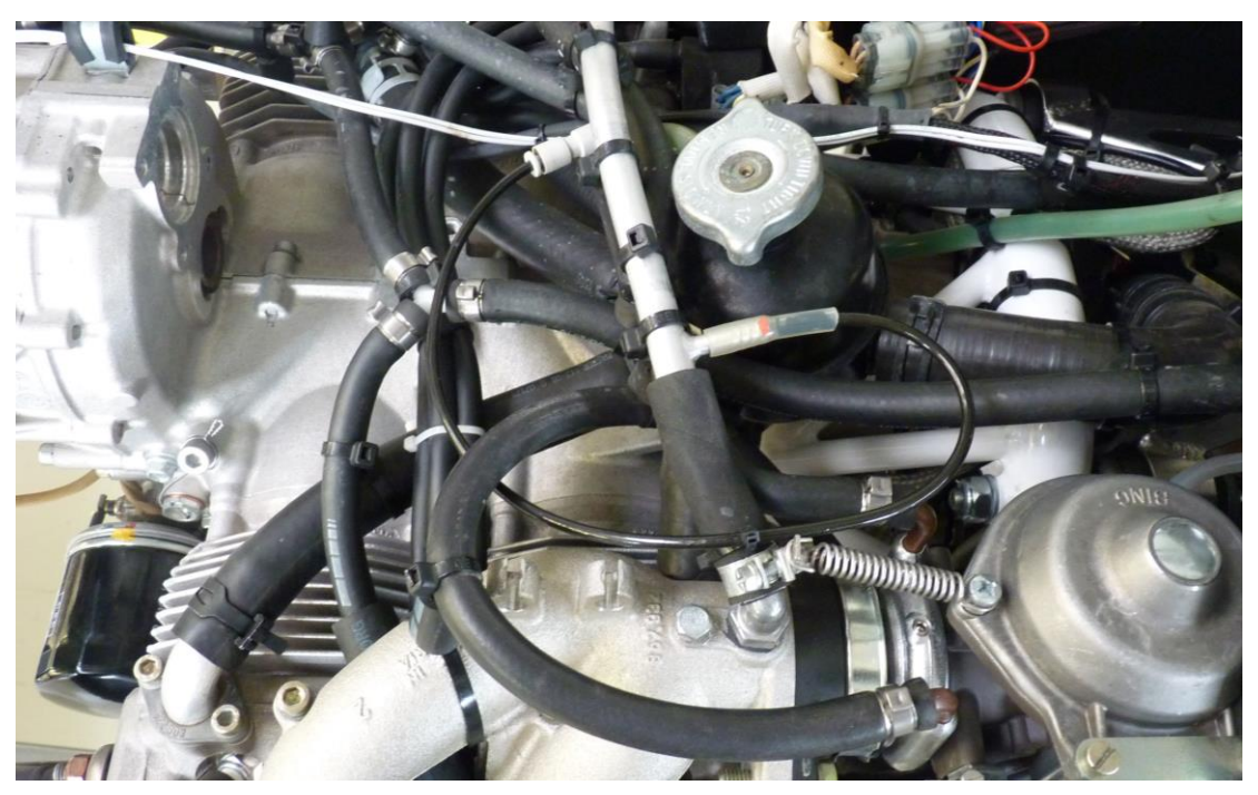
Fig. 4 – Manifold pressure hose connected on engine side