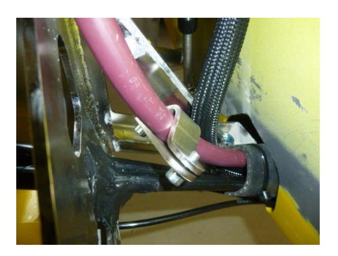
Fig.2: Position of PPC clamp