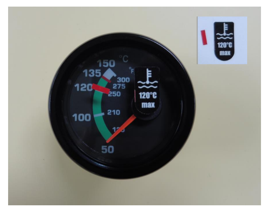
Fig. 3 – Modification of the CHT indicator to CT indicator