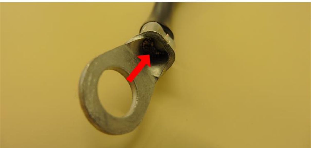
Fig. 1 – Inaccurate crimp connections