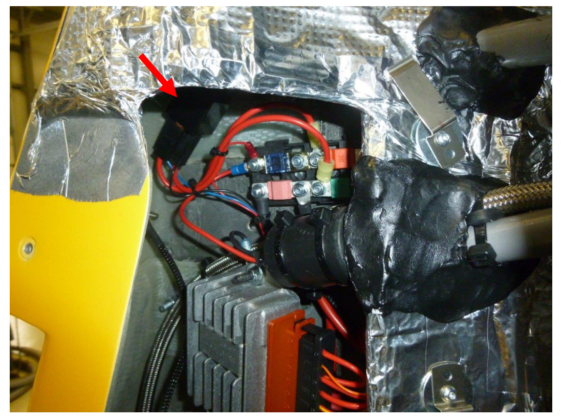
Fig. 3 – Position of the fuel pump relay (Cavalon)