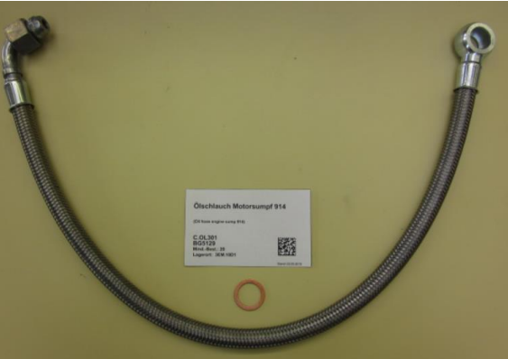
Fig. 3 – Steel braided oil hose (new)