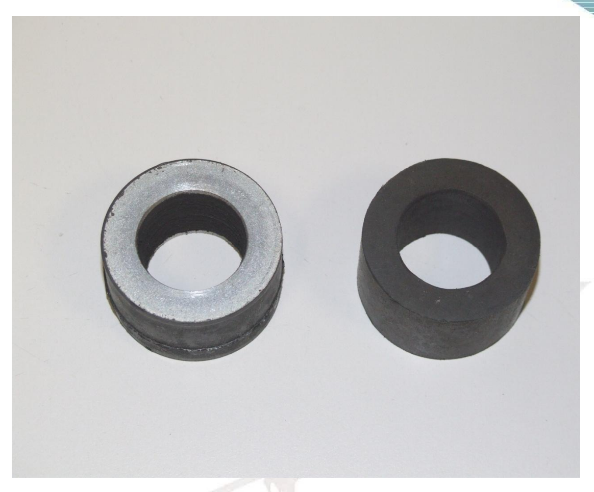
Fig. 1: Rubber damper with volcanized metallic discs